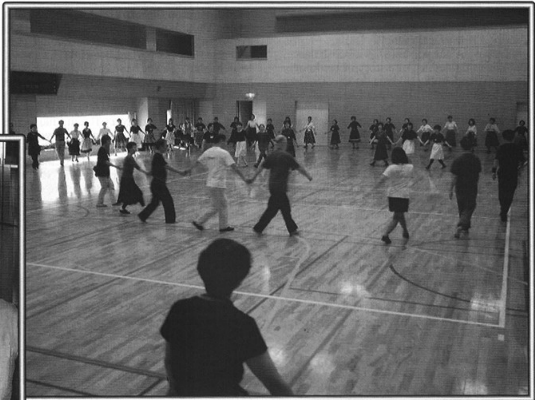
The dance halls everywhere were luxurious, with parquet floors, outstanding amplification systems, comfortable toilets, and boards for registering the names of the dances taught. Above - The dancing hall in Kyoto