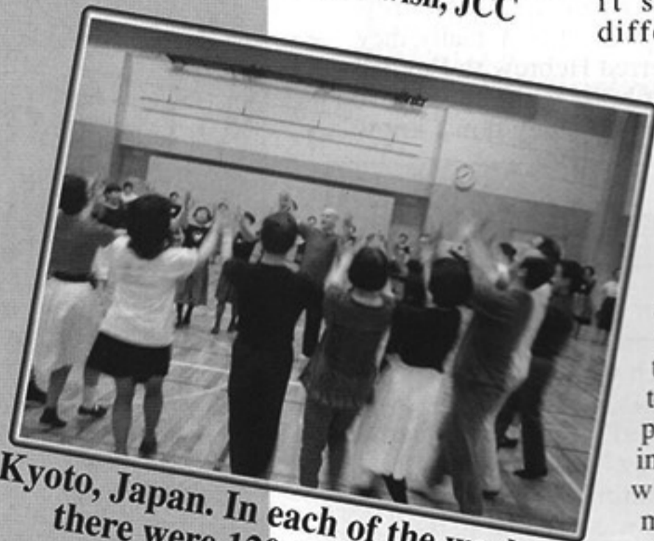
Kyoto, Japan. In each of the workshops there were 120-140 participants