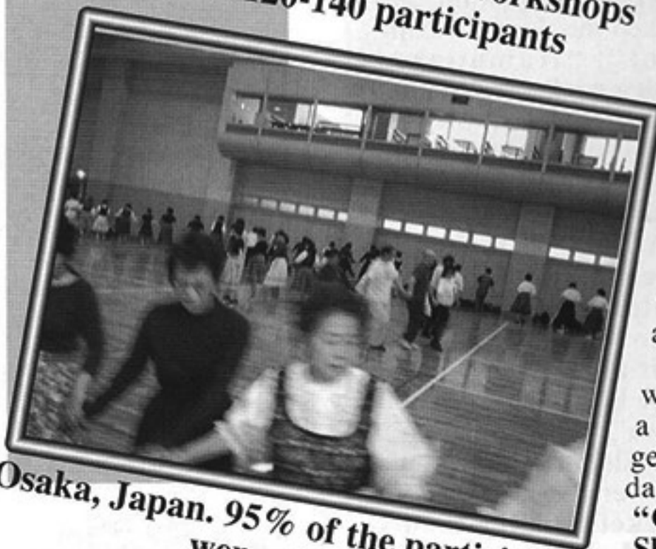
Osaka, Japan. 95% of the participants were women