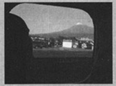
View of Fuji mountain through the train window

They were puzzled about the position of their hands in a circle dance where holding hands was not required. They always hold hands when dancing in a circle, and can't understand why it should be done differently