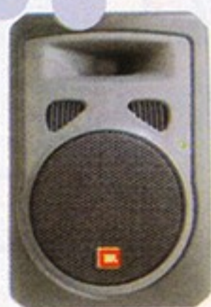
Eon 10 inch 2 רמקולים + 2 מגברים 250W R.M.S