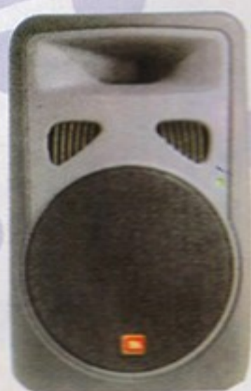
Eon 15 inch 2 רמקולים + 2 מגברים 350W R.M.S