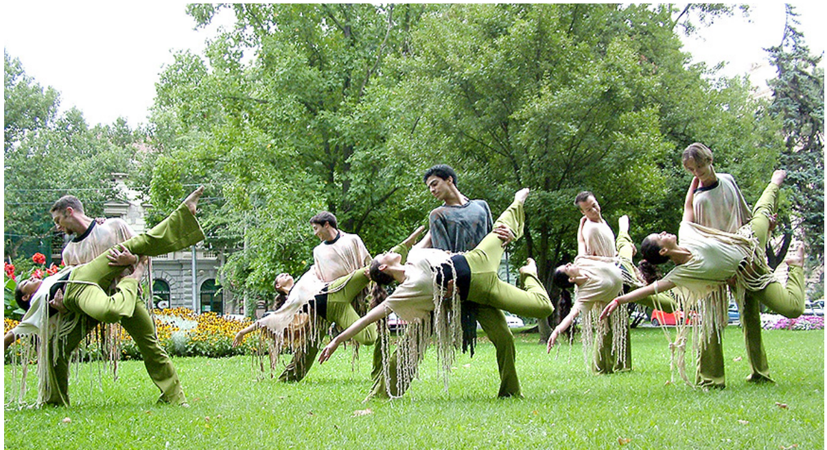
Ayalot Ha'Negev (bogrim) at a park in the city Saged in Hungary

At the conclusion, the troupe danced again with the winning troupes and was filmed for Austria National Television and for five additional networks. The event was said to