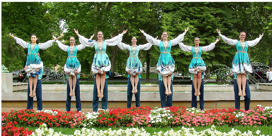
Ayalot Ha'Negev (bogrim) at a park in the city Saged in Hungary

came to dance in the troupe. I wanted to present Israel to the world from other aspects of culture and dance. From thousands of dancers, I chose only the best dancers. I understood that I need to start at the bottom and choose only those dancers with the appropriate qualifications to fit into representative troupes. Ayalot is comprised of the following groups: Efrochim (chicks), Ne'urim (youth), Studentim (students) and Bogrim (adults).