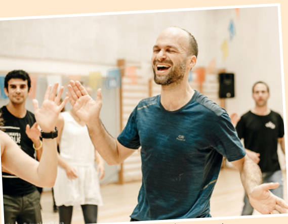
Abundant pleasure and joy erupts