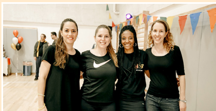
Members of the Jerusalem Komuna arrived at the opening event in Tel Aviv