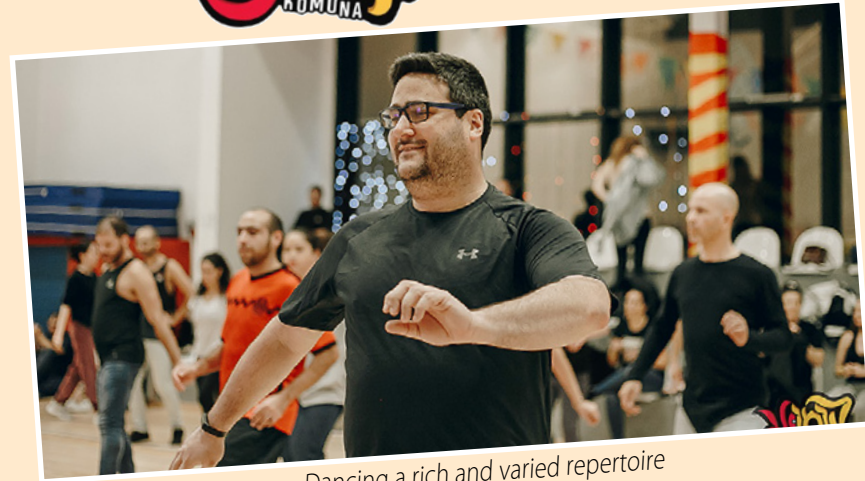
Dancing a rich and varied repertoire