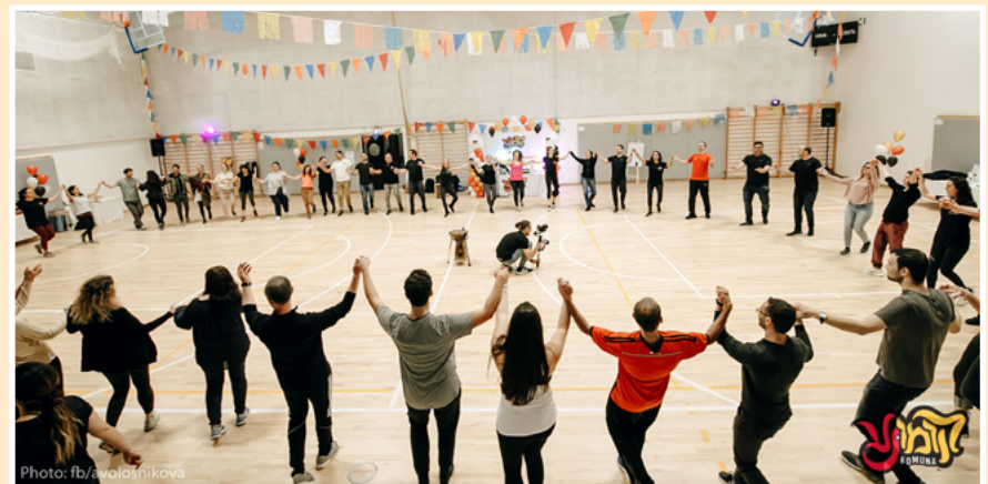
Closing dance of the evening