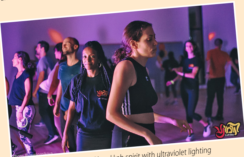
Dancing in the Hanukkah spirit with ultraviolet lighting