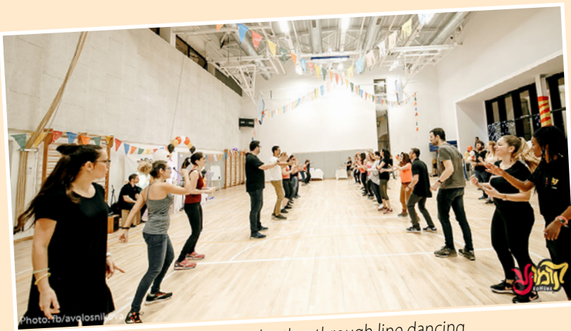
Getting to know each other through line dancing