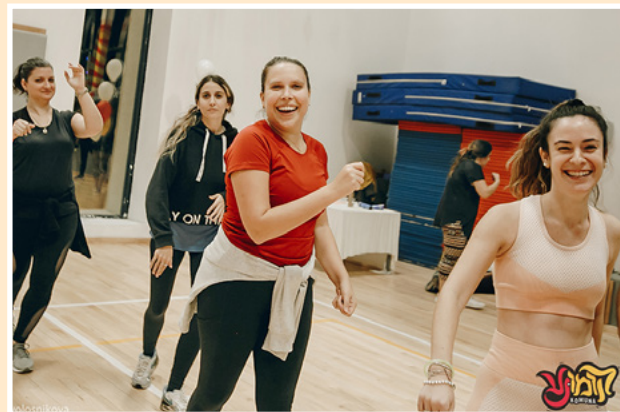
Dancers become acquainted thanks to Komuna