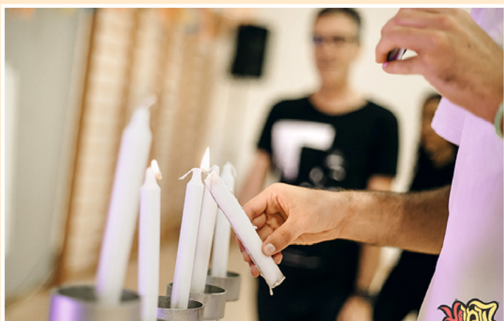
Hanukkah candle lighting