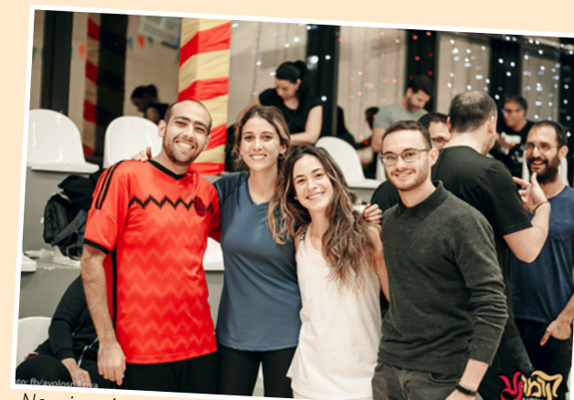
New immigrants from around the world integrating into Israeli society through the culture of Israeli folk dance