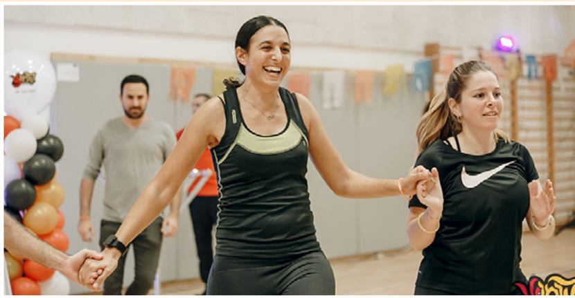
A veteran dancer helps to integrate new dancers