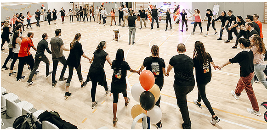
Holding hands in one circle as the grounds to connect members of Komuna