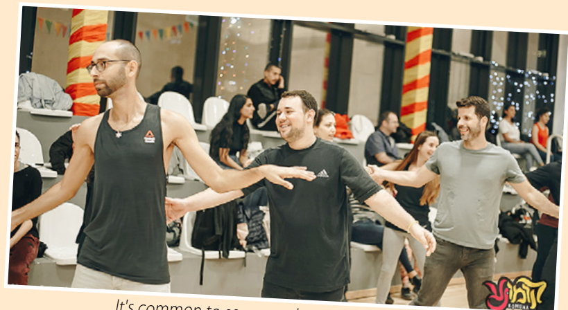
It's common to see many boys on the dance floor