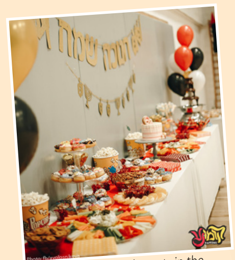
Plentiful refreshments in the light of Hanukkah