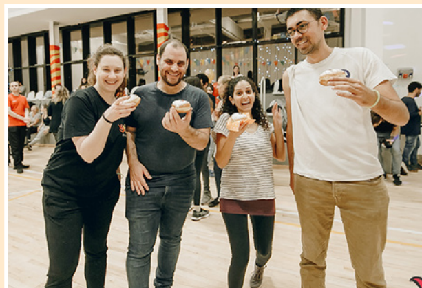
Dedicated time during the dance session to connect with each other