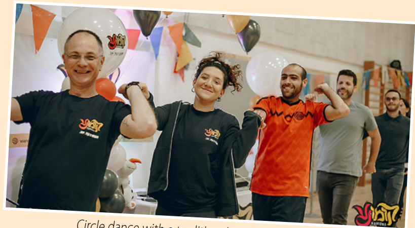
Circle dance with a traditional style of holding hands