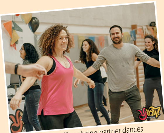
Dancers smiling during partner dances