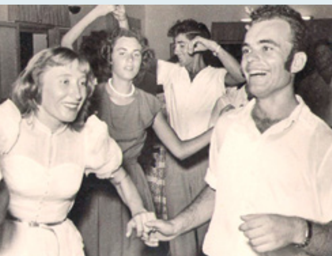
The wedding, 1953