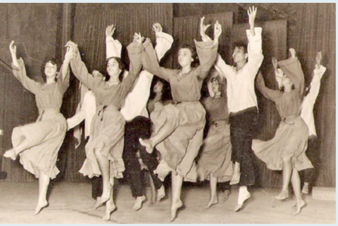
Pa'amei Machol in Heichal HaTarbut, 1968