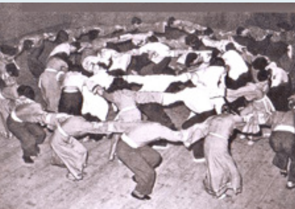
Rikud Ha'Emek, 1954