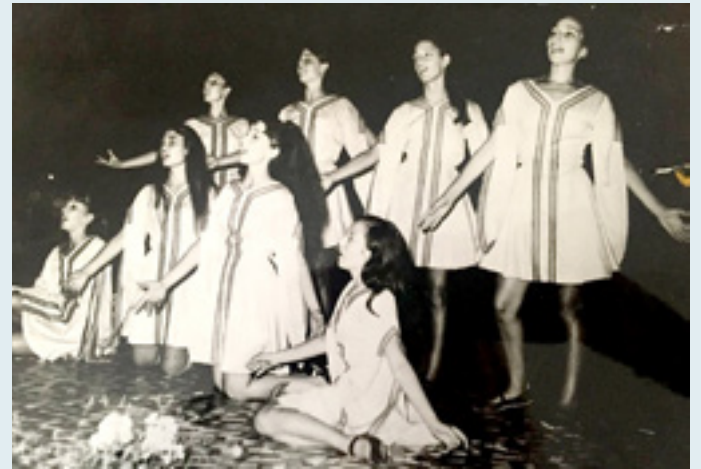
Pa'amei Aviv, 1969