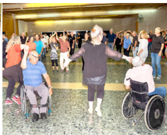
Those in wheelchairs also danced with us