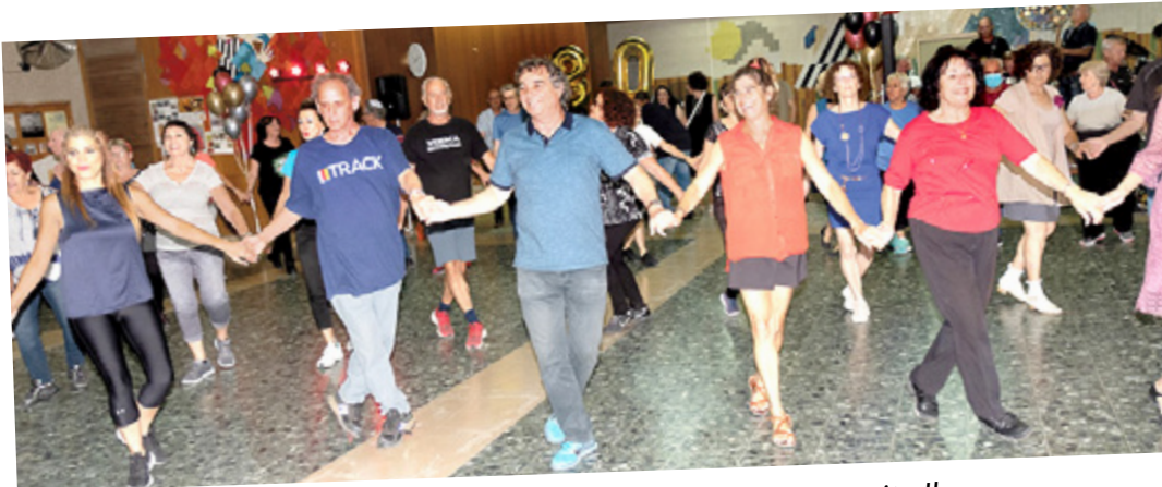
The smiles on the dancers' faces that says it all