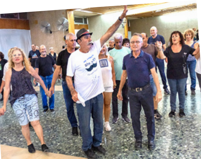
In the center of the circle and in the center of things