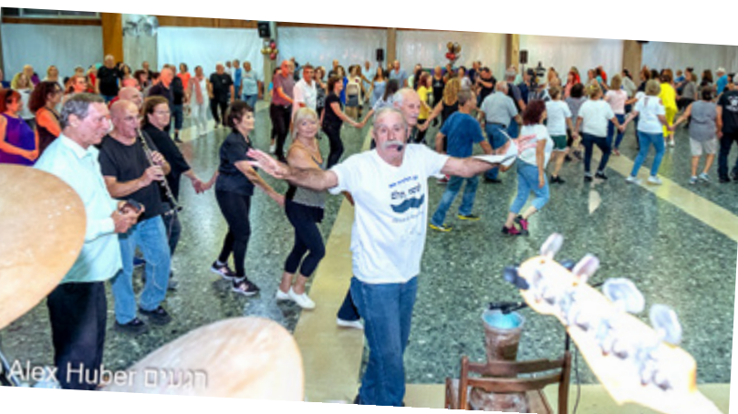
Turning to the orchestra with the dancers in the background

Wow... what beautiful circles with dancers holding hands!