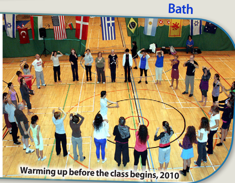
Warming up before the class begins, 2010