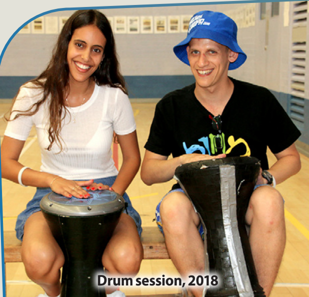
Drum session, 2018