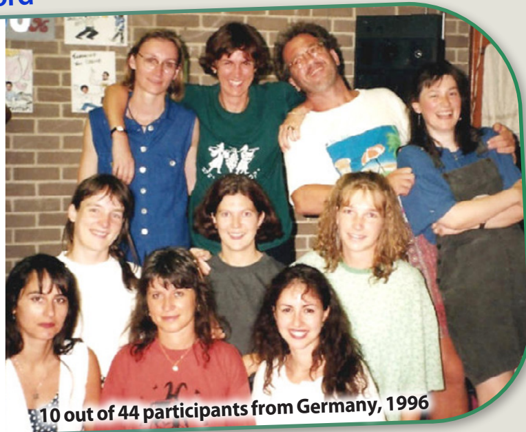
10 out of 44 participants from Germany, 1996