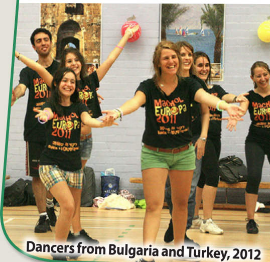
Dancers from Bulgaria and Turkey, 2012