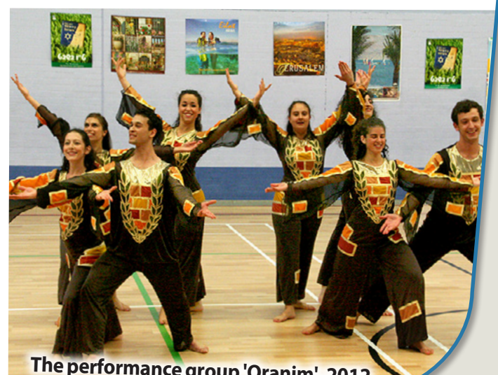
The performance group 'Oranim', 2012