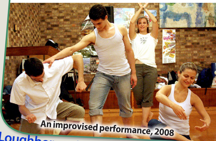
An improvised performance, 2008