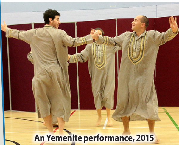
An Yemenite performance, 2015