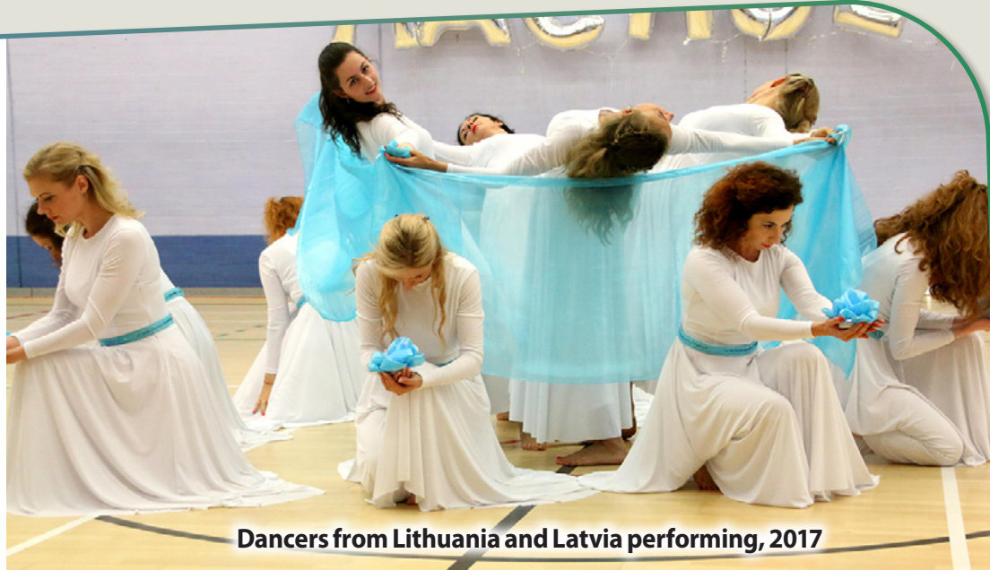
Dancers from Lithuania and Latvia performing, 2017